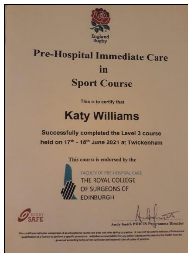
Figure 4: Certificate of completion

This culminated in me having to pass a written paper with an 80% pass mark and a moulage simulation. During my moulage I got a concussion, a tension pneumothorax, a lacerated spleen and a fractured dislocated ankle. Thankfully I passed both sections (see Figure 4) .....this one is for you Alex! Thank you MACP!