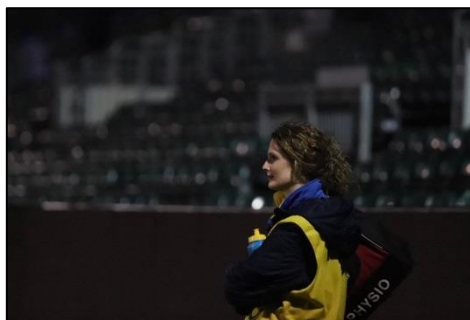
Figure 2: Me in action

I am a Senior Musculoskeletal / Sports Physiotherapist based at the University of Bath (UOB) https://www.teambath.com/ (see Figure 2) (2). A Contractor Physiotherapist for the English Institute of Sport https://www.eis2win.co.uk/ (3) and Guest Lecturer, Examiner and Clinical Placement Co-ordinator on the MSc in Sports Physiotherapy at the University https://www.bath.ac.uk/courses/postgraduate-2021/taught-postgraduate-courses/msc-sports-physiotherapy-part-time-distance-learning/ (4).